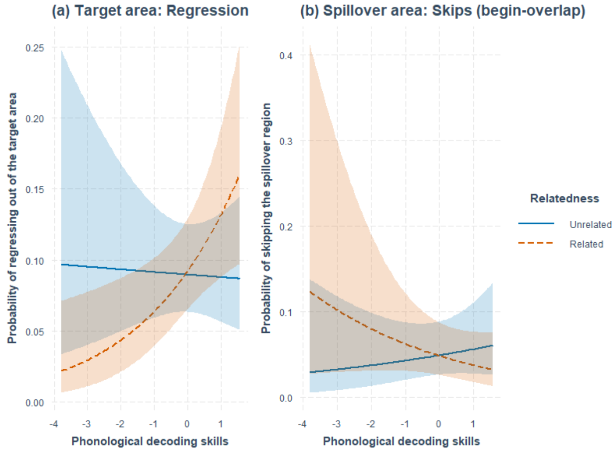
Figure 1. Plots for significant interactions between relatedness and individual difference predictors in the short-distance condition